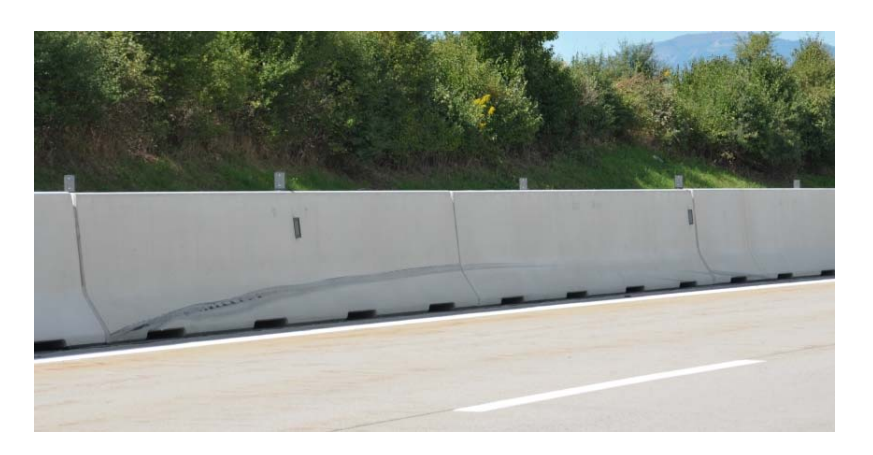
abrasion marks, system not damaged