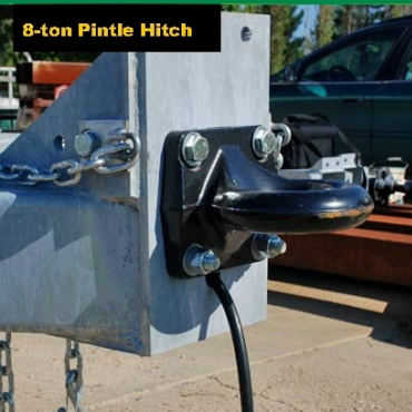
8-ton Pintle Hitch

Patented tube bursting technology. As illustrated in the graphics above, an over-sized mandrel is pushed into the smaller tube and splits the tube into four straps of metal while dissipating the impact energy. The metal straps remain with the trailer and do not pose any hazard to adjacent traffic. This allows the trailer frame to also serve as the energy absorber, simplifying the design and reducing cost.