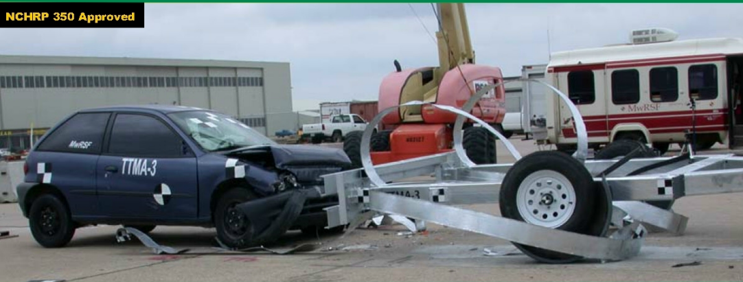
NCHRP 350 Approved

NCHRP 350 TL-3 compliant. Successfully passed all NCHRP 350 required and optional crash tests with the support vehicle blocked against all forward movement (worst case scenario) for test level 3 (TL-3) conditions at an impact speed of 62 mph. Photo shows result of small car head-on test. Note the relatively minor damage to the vehicle and lack of loose debris.